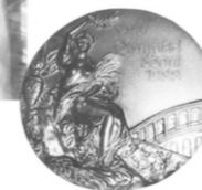
Gold at Seoul