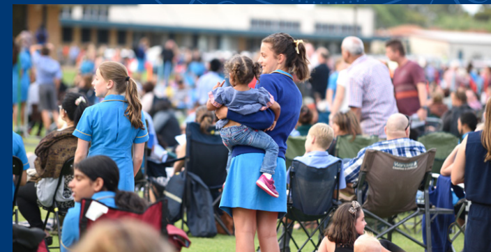
Families gather for the 2016 College Community Mass.

Classes have changed, MacBooks have arrived, new subjects have been born and students have different hair styles, different ways of speaking and so on, but some things never change. Students who love to kick the footy on the oval at lunchtime, students who form social groups that will last for years after they leave school, the happiness you feel when a student discovers they have a